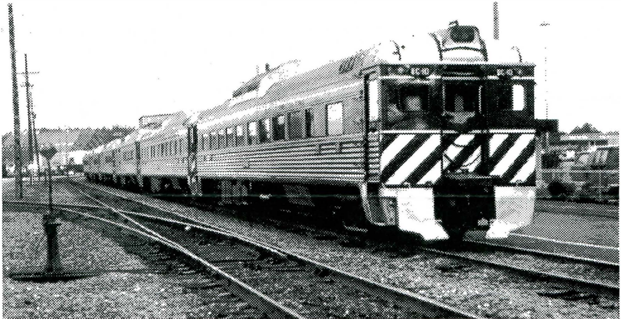
A six car Cariboo Dayliner sits in Vancouver BC. BC Rail still uses RDC's for passenger service. This train consist of three RDC-1s and three RDC-3s.

Rail Diesel Cars were an attempt at cost effective rail transportation in the waning years of passenger service. The New York Central bought the first RDC from the Budd Company in 1950; during the twelve years of RDC production, five different versions were manufactured, for a total of 398 cars on many US and foreign railroads.