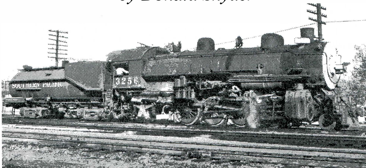
Southern Pacific 2-8-2 #3256 performs switching chores at Roseville, California in March, 1950.