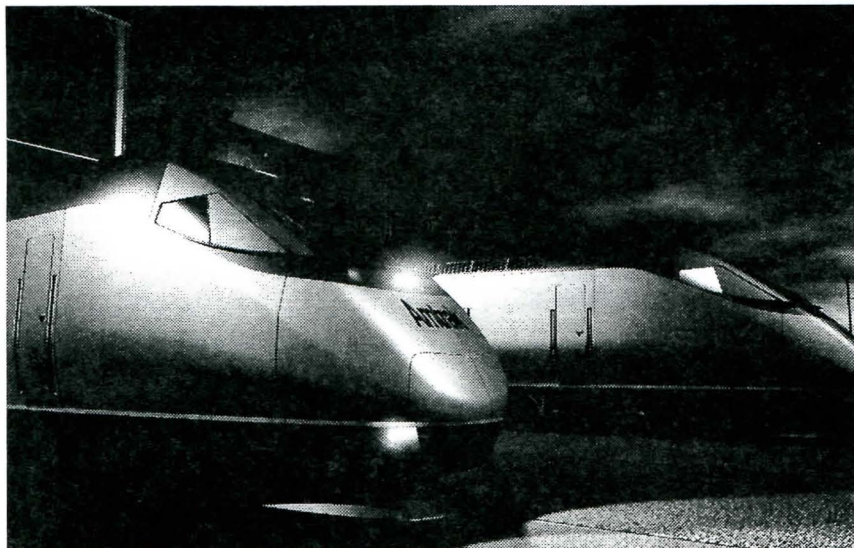
This computer graphic depicts two of Amtrak's new high-speed trainsets at the Ivy City maintenance facility at the turn of the century

Any before 1962 1962: Jan., Apr., Dec. 1965: July 1966: Oct., Nov. 1969: Jan.-Apr. 1971: July, Aug., Dec.