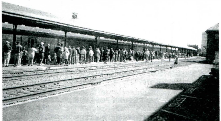
This is a view of the same track area, from the station side of the tracks. The open area above the umbrella shed would be occupied by the proposed pedestrian overpass.