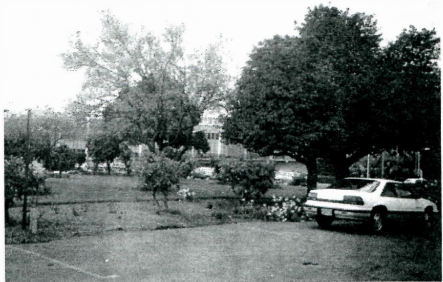
This is the landscaped area, looking northwest, next to Wilf's Restaurant and Union Station that would be affected by the proposed pedestrian overpass.

Recently, after a few years' delay since the removal of a majority of the Union Station yard trackage, development plans are in the works for the yards. 330+ rental units, 50+ townhouse units and a community center are planned for the area between the remaining tracks (Tracks 1-5) and N.W. Naito Parkway (recently renamed from N.W. Front Ave.). Included in this proposal is a pedestrian overpass, with elevators, to straddle three stories above the tracks, from the developed area to