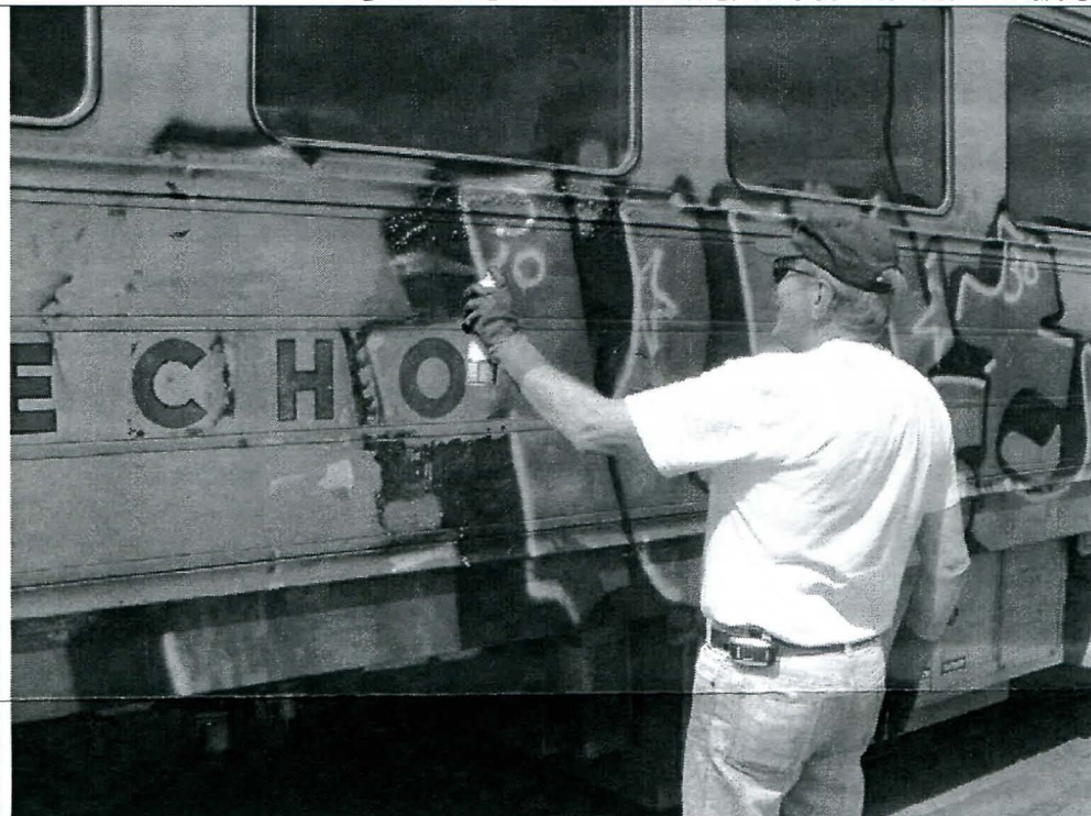
passenger coach Echo Canyon

While other Chapter members use their talents to work on the 6800 truck, this shows that there is work for even the semi -talented.