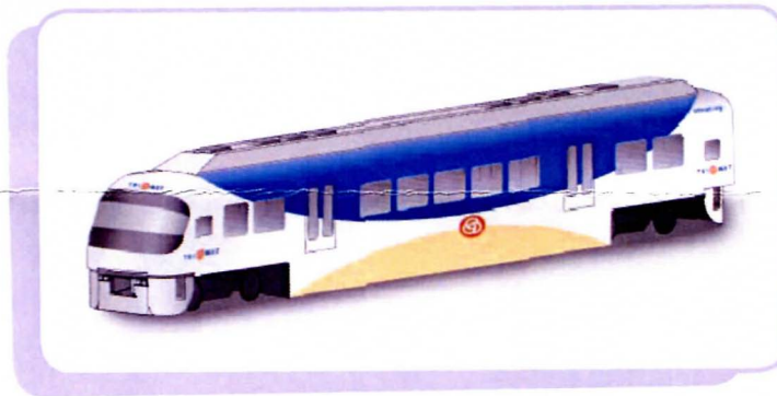
TriMet purchased five diesel multiple unit rails vehicles from Colorado Railcar.

The DMU's average speed will be 37 mph, with a maximum speed of 60 mph. Each DMU is equipped with two, 600 horsepower Detroit Diesel engines. All cars will comply with stringent federal safety requirements for passenger cars sharing track with freight.