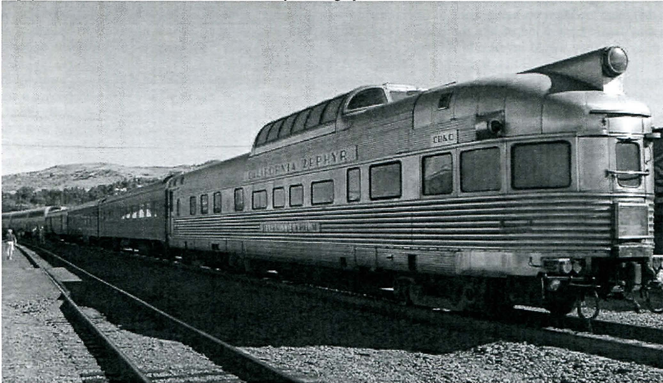
Zephyr Round End Observation Car. What a way to bring up the end of a train.

I wanted to point out another little known fact. If you want to have 120 volts available to run your computer or charge your cell phone, or watch movies after dark like I did, there's a plug, (the only one), at seats 15 & 16 in the coach cars. I had one of my power strips with me so that I could run more than one thing at once along with sharing power with some of my neighbors.