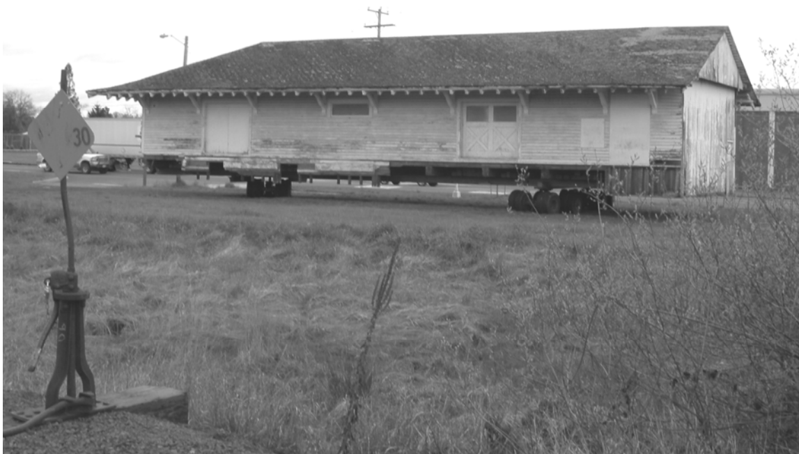
School and west of the railroad

Shown here on March 14 th , the Monroe Depot was successfully moved on March 11, 2007 from its former location. Benton County is working with Union Pacific Railroad to acquire this property for a new library which will incorporate the depot. This is across 99W from Monroe High.