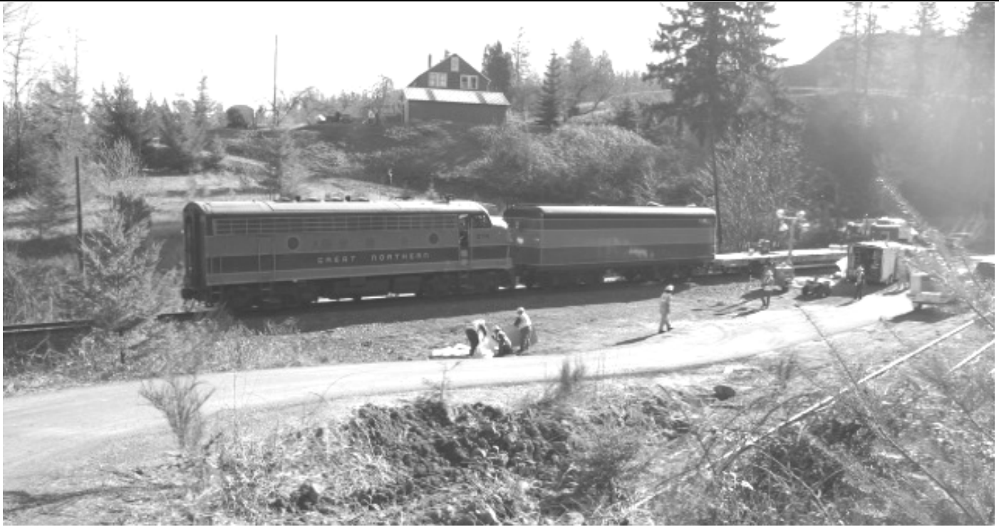
Photo at the west portal before loading the fire truck; David Anzur photo.

have to be scrapped. As a solution to this new problem, the train with fire truck would remain outside the west portal and some 3000' of fire hose was laid into the tunnel for P&W crews to fight the fire. Special nozzles were built by Doyle on February 3 rd that were used both on a track hoe and hand held.