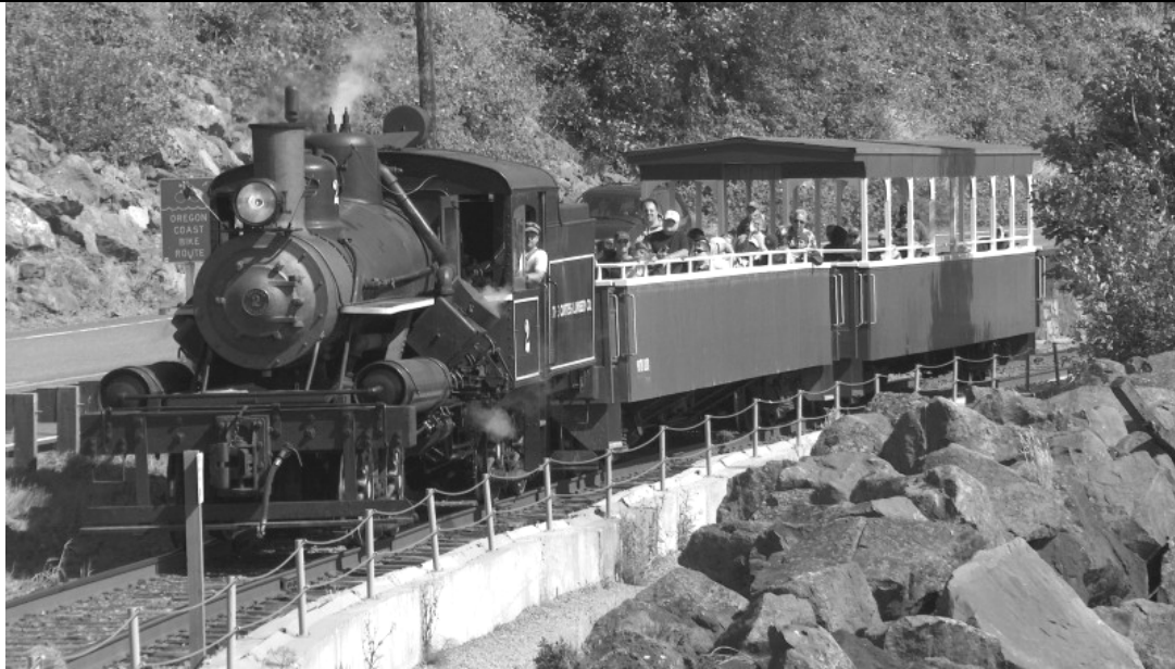
Curtiss Lumber Co. No. 2 Heisler

includes three Heislers and two Shays. A Skookum 2-4-4-2 Mallet is being restored under contract and may stay once operational. The 1909 built Curtiss Lumber Co. No. 2 Heisler has been restored to operating