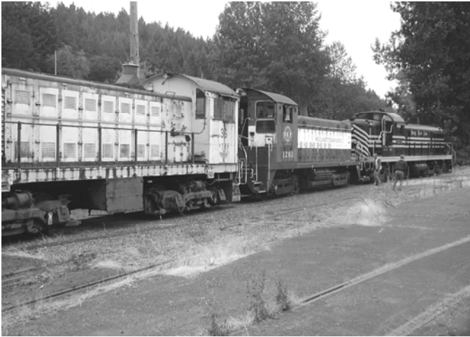
S-2 #36, P&W 1201 and Nickel Plate Alco #324 RSD-5 @ Linnton