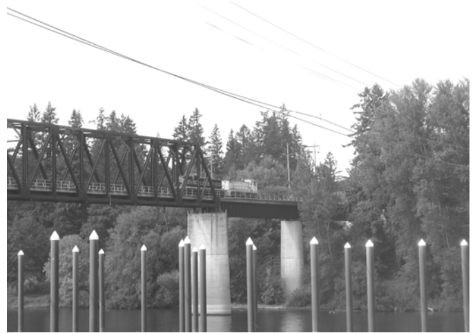
Consist crossing the Willamette River @ Wilsonville