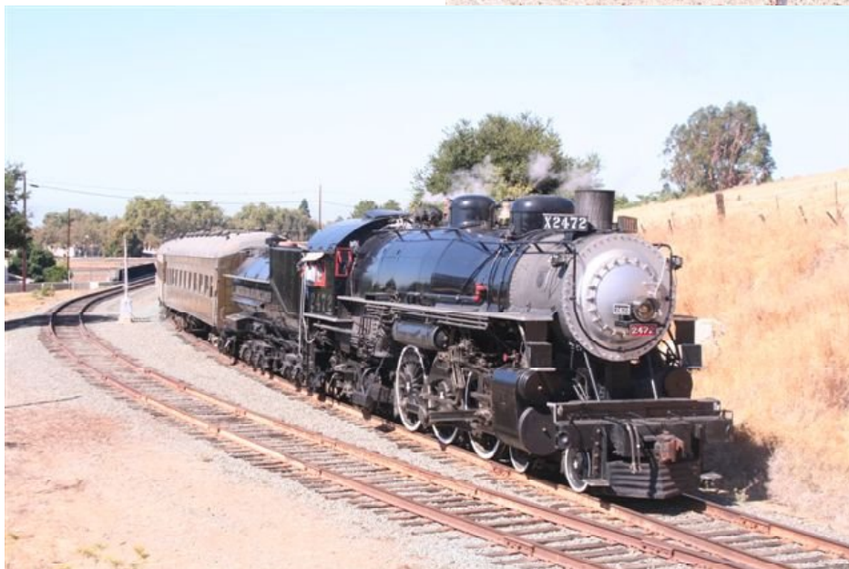
Former SP #2472 heading into Niles Canyon pulling a consist of three restored Harriman passenger cars.