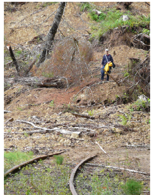
Right: Christopher Bowers is pictured standing near the east portal of Tunnel #25 3.5 miles west of Timber on the POTB Railroad on 7.5.2008.