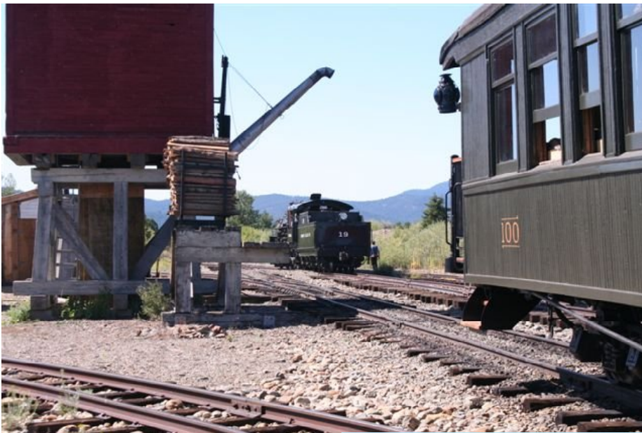
Left: Sumpter Valley #19 positioning near water tank at McEwen, Oregon.