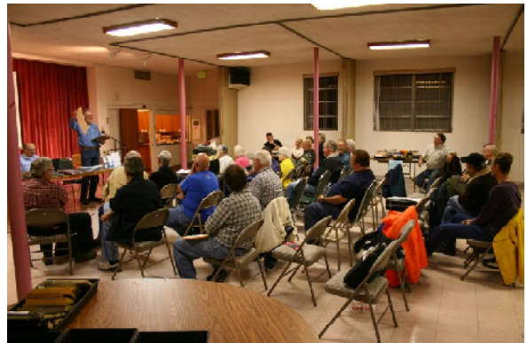
Right: Monthly membership meeting in the basement of Saint Mark's.