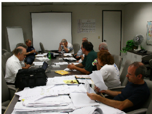
Left: Our current Board of Directors, hard at work.