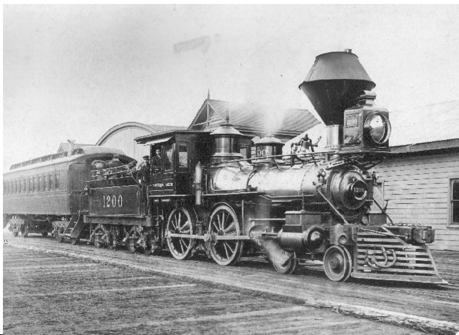
Left: SP #1200. The locomotive is believed to be a McKay and Aldus product, outshopped in 1868 for the Central Pacific as their #66. She was relatively long-lived, lasting until 1909.