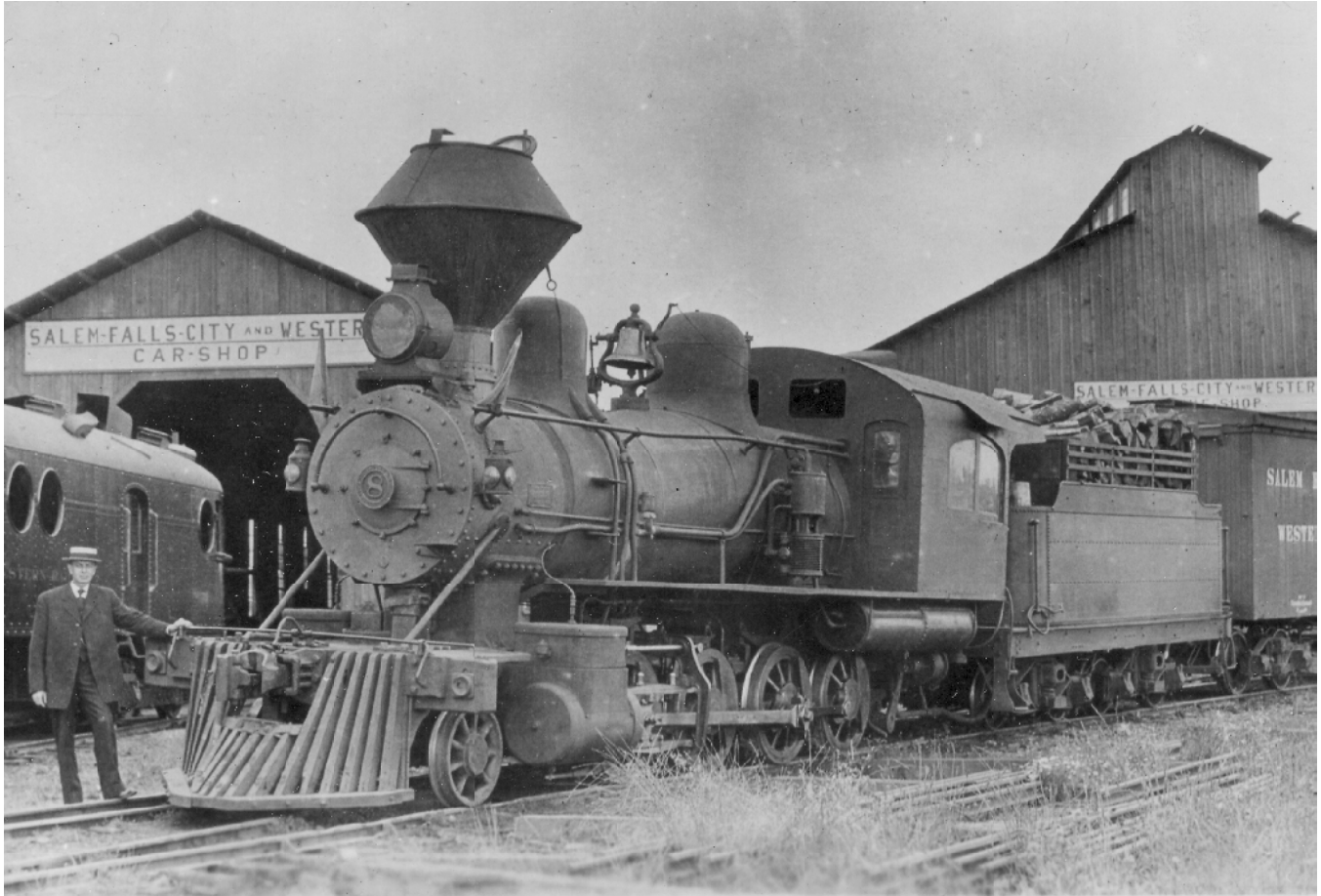
Above: The Salem, Falls City and Western car shop. McKean motor car #1 (left) posed with wood-burning Consolidation #8 for this photo.