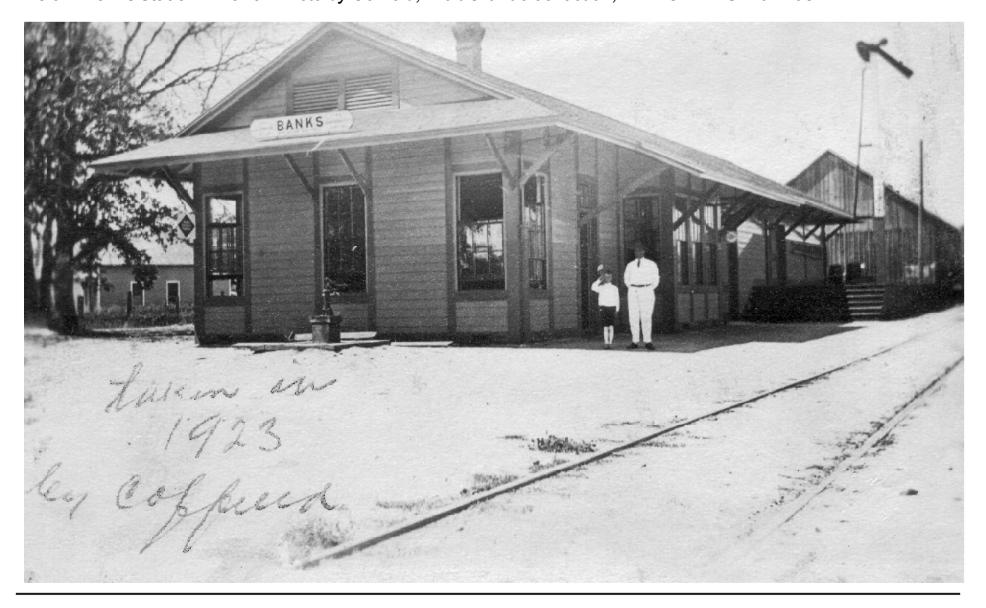
Page 10 June 2009 Pacific Northwest Chapter National Railway Historical Society The Trainmaster

Below: Banks Station in 1923.