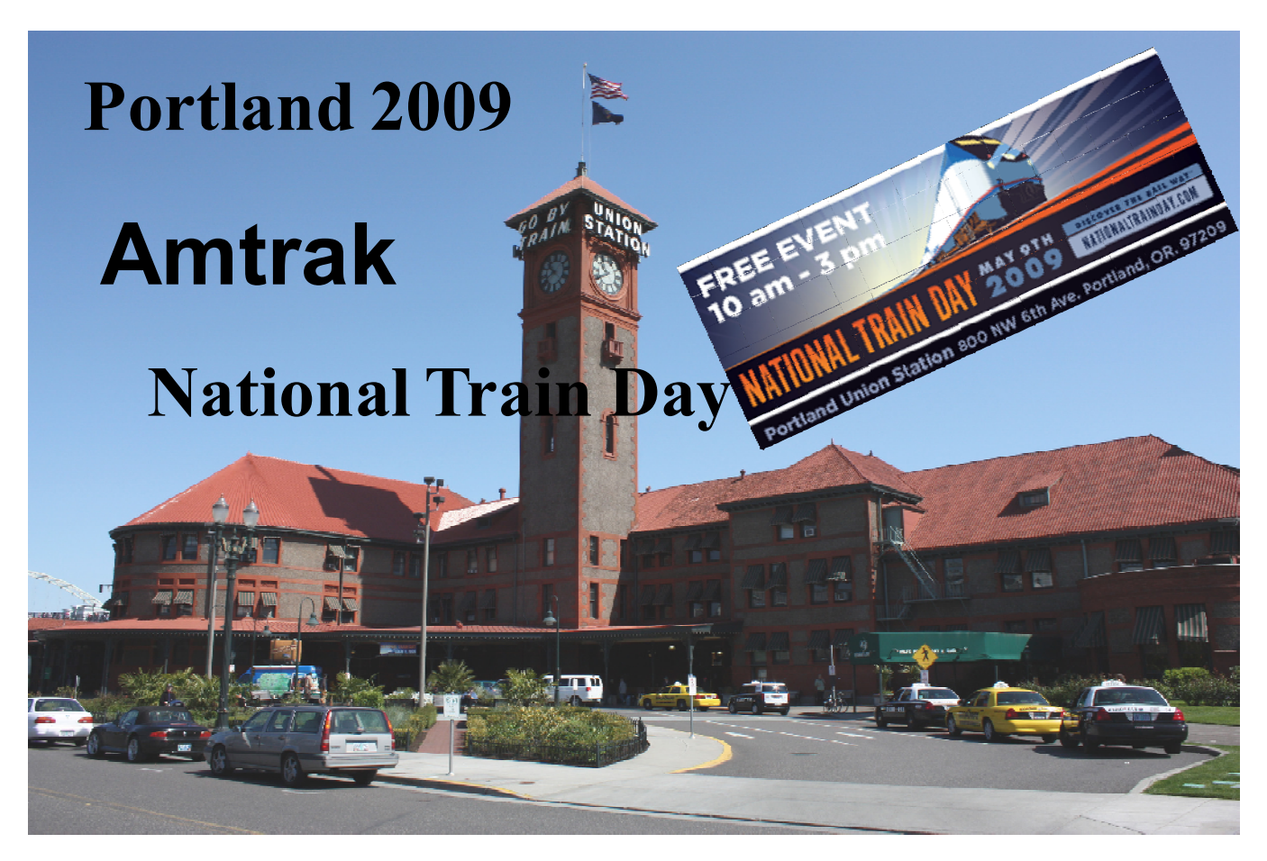
by Arlen L. Sheldrake

The May 9 celebration is now history and the many volunteers are getting some much-deserved rest. Planning (maybe plotting is a more accurate term) for National Train Day (NTD) 2009 started soon after the first NTD in 2008.