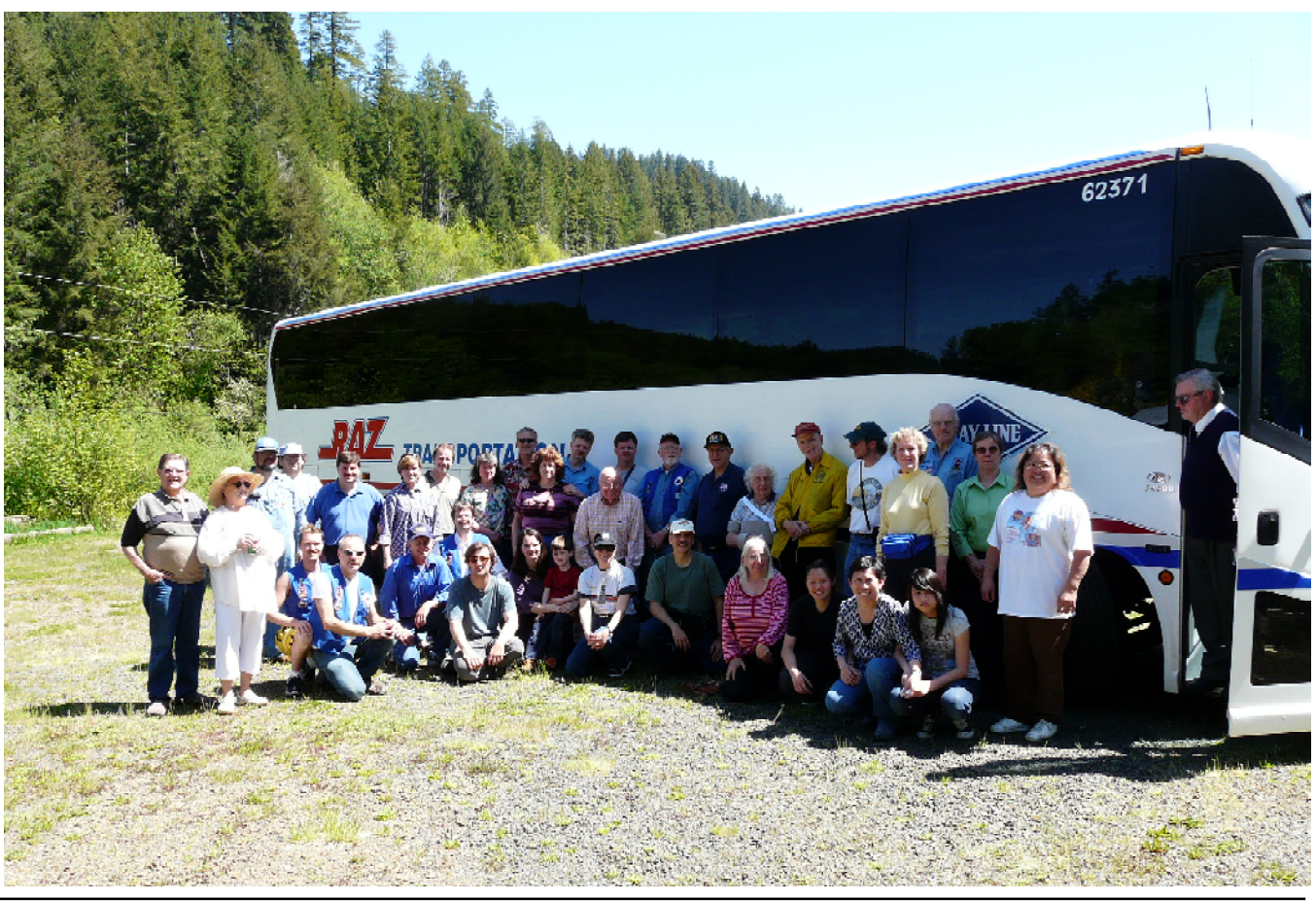
Page 6 July 2009 Pacific Northwest Chapter National Railway Historical Society The Trainmaster

As a closing note, not long after our excursion, the M&LKRR announced via their website that the railroad will likely have to be dismantled due to ongoing efforts of a few county and state agencies. More information about this and the M&LKRR can be found at www.savemlkrr.com.