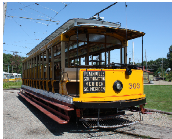
Above: This beautifully restored Connecticut Company open car resides at the Seashore