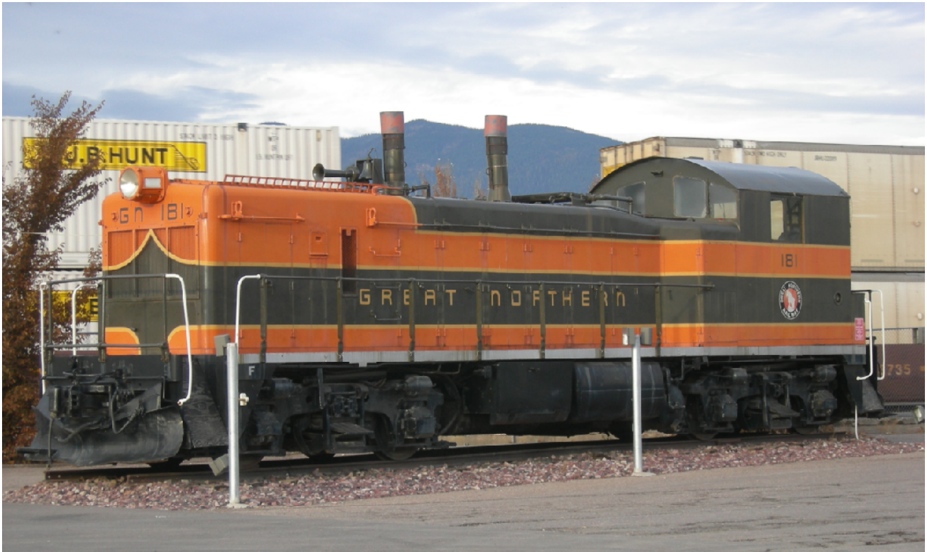
On display in Whitefish, Montana, above, is Great Northern #181, a rare NW3 EMD road switcher. The #181 was originally GN #5406 and was one of only seven of the type ever constructed, all going to the Great Northern. Despite its size, it only boasted 1000 horsepower. The #181 was the last of the series and was outshopped in March of 1942.