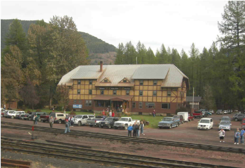
Left: The Superdome provided an excellent platform to view the Izaak Walton Inn, located in Essex, Montana. The Inn started life as a Great Northern crew hotel but has since been developed as a private vacation spot. It's proximity to the tracks makes it highly desirable for railfans.