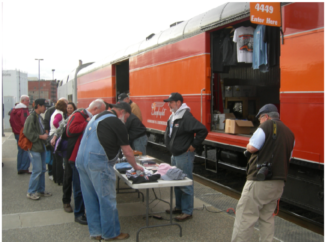
The Friends of 4449 did not waste any opportunity to open their concession stand. Here they are shown hawking their wares in Spokane, Washington.