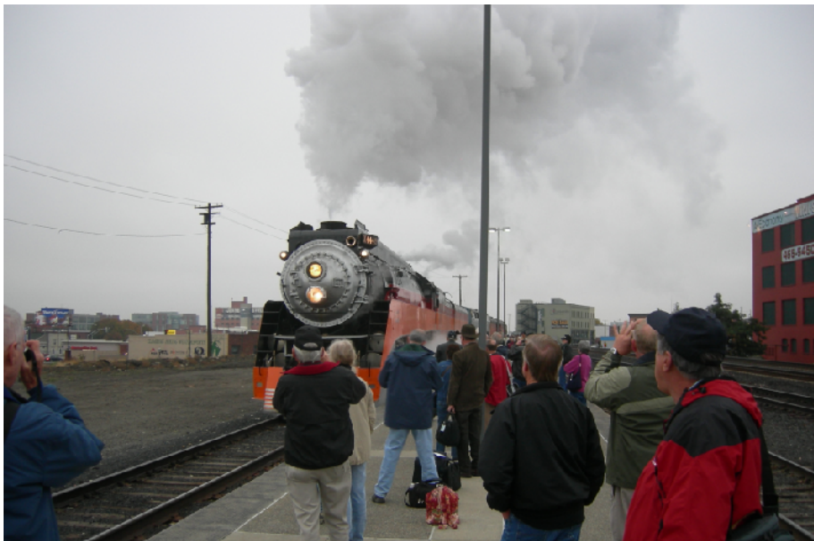
In a mild overcast, 4449 and her train arrive in Spokane in preparation for the last leg of the trip to Portland.