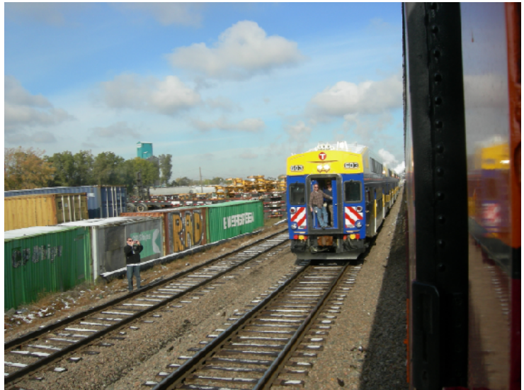
The Northstar Commuter Rail service opened November 16 from Big Lake to Minneapolis, Minnesota. Photos were being taken from both trains.

As noted earlier, we had two layover days, one in Minot and one in Whitefish. In Minot, the consist was parked right in front of the BNSF crew change office. The weather was chilly but the snow stopped