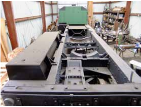
The Willamette's frame is offset to the fireman's side. Restoration work has resulted in a frame that looks as good as when the locomotive rolled out of the Portland plant.