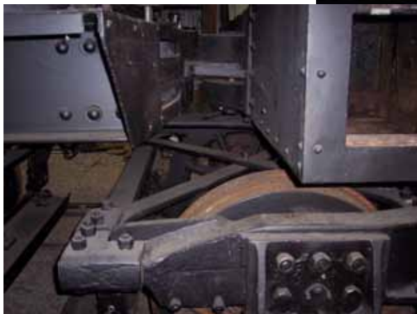
Left: The connection between the main frame and tender is a simple, though rather stout, pin. Photo: Steve Hauff

The girder frame precluded free access to the staybolts on the side of the firebox, so Willamette punched holes over the (theoretical) staybolt positions. Photo: Steve Hauff