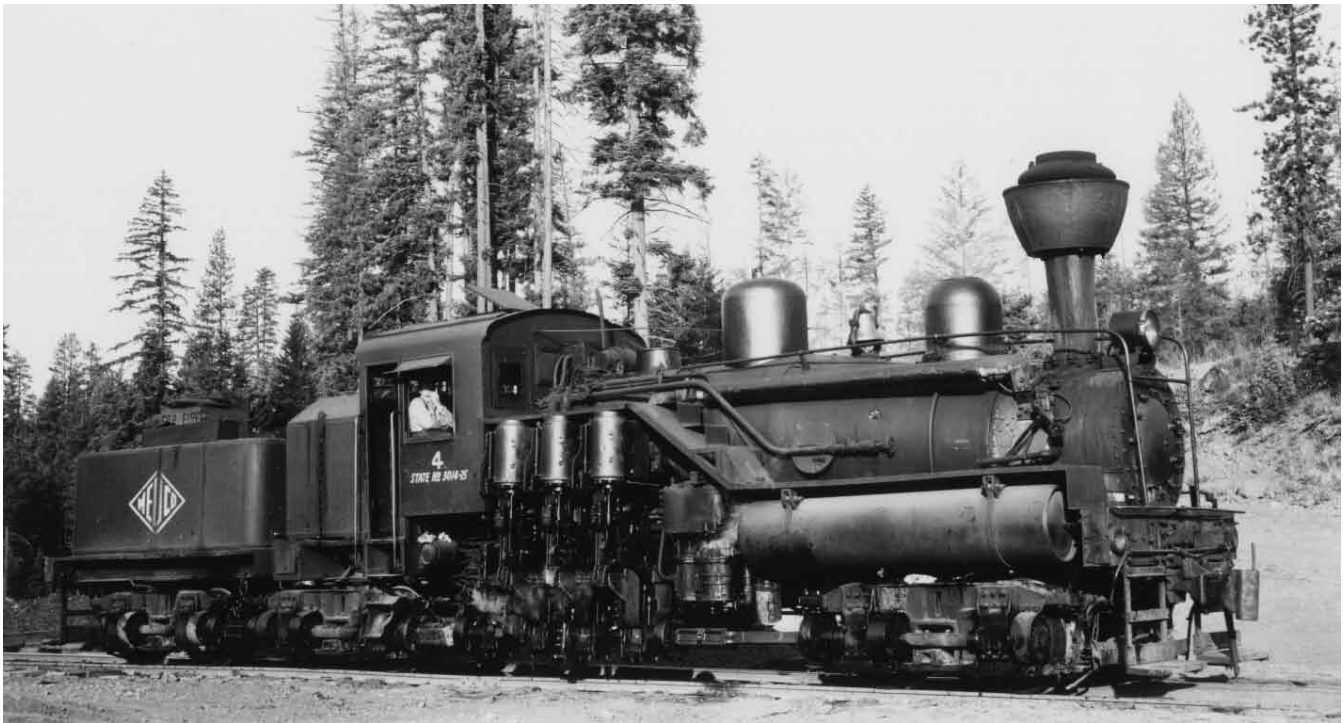
On June 18, 1957, this photo of #4 was captured at Medco Pond.

on the memo line, and mail it to: Southern Oregon Chapter, NRHS; PO Box 622; Medford OR 97501.