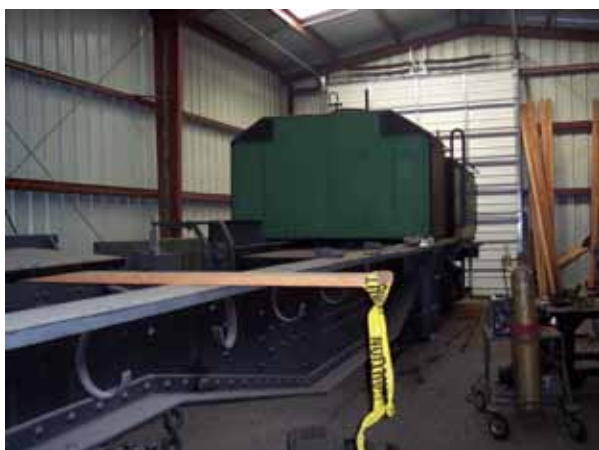
On many of the locomotives, a series of hooks were installed along the left side of the frame, under the running board. Working photos of the locomotives show that these were used for the steam siphon hose, rerailing frogs, chains, cables and other assorted equipment.