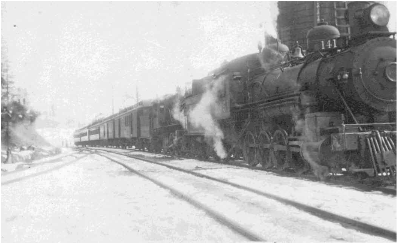
In 1921, the photographer caught train 141 at Cochran, Oregon. The 4-8-0 was built by Schenectady in 1892 and spent the last years of its operation leased to the Northwestern Pacific. The locomotive finally met the scrapper's torch in 1952.

Train" arrived each Friday afternoon carrying Portland men who, after working in the city all week, would join their vacationing families. The railroad's legacy in Rockaway Beach is obvious in the red caboose that houses the Rockaway Beach Chamber of Commerce at the Wayside.