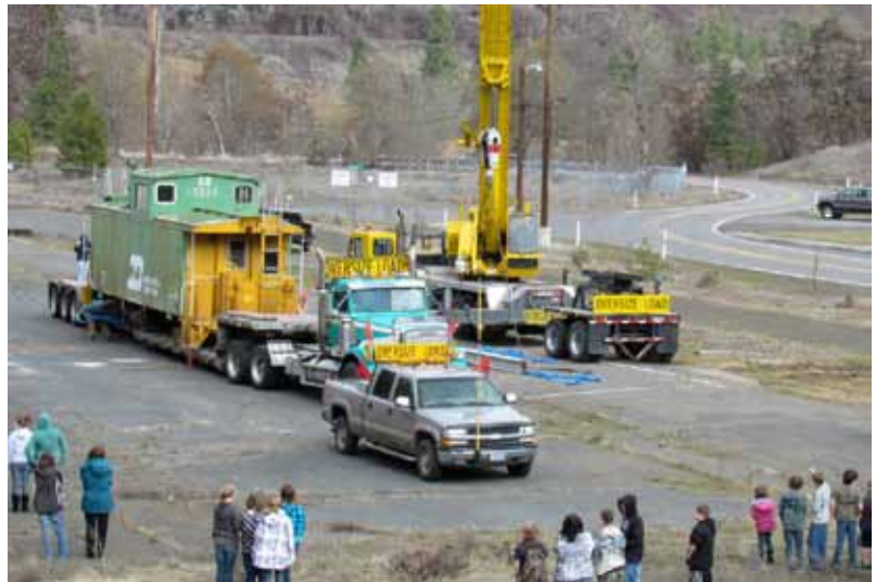
Above: The caboose arrives in Klickitat on a lowboy supplied by Redmond Heavy Hauling. Left: The caboose was carefully lifted from the lowboy and placed on its trucks. Accurately dropping a railcar on its centerpins is no easy task.

in Klickitat remained open until July 1994, but they had switched from rail to trucks by 1992, making the Lyle to Klickitat stretch obsolete.