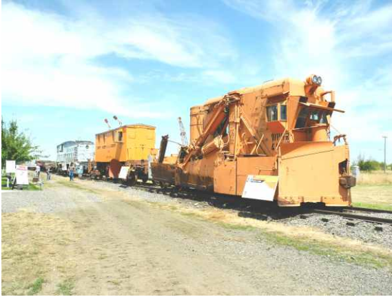
The Chapter's "Maintenance of Way" Exhibit at Powerland