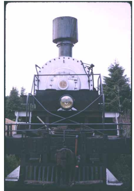
June 22, 1985: View of the front end of steam locomotive No. 38 at Rayonier Incorporated's railroad camp. Possibly part of railroad Camp 14.