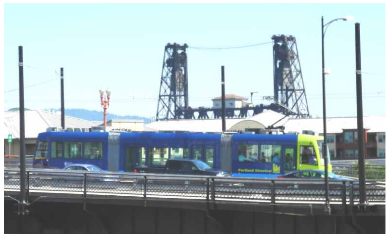
Portland Streetcar testing on the Broadway Bridge Ramp

The Portland Streetcar is excited to open its newest line, the Central Loop, on September 22, 2012. The celebrations will start at 10:00AM with a Press Event and speeches at the OMSI Plaza in SE Portland. Service will begin by 11:00AM following the press event and the departure of the first, ceremonial train. The Central Loop will connect with the existing streetcar on 10th & 11th in Downtown Portland. From there it will cross the Broadway Bridge traveling along Broadway, Weidler, 7th, MLK and Grand connecting to the Rose Quarter, Lloyd District, Oregon Convention Center, the Central Eastside Industrial District and OMSI.