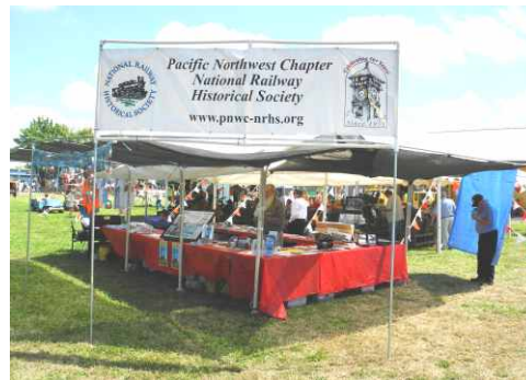
Overview of the PNWC Concessions area at Powerland