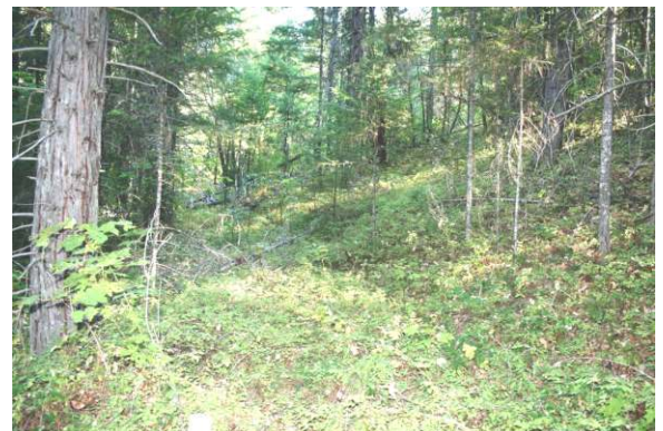
The old roadbed near Sardine Creek is hardly visible through the undergrowth since the rails were removed 92 years ago.