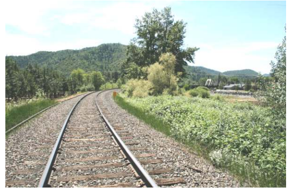
This is looking north on the SP at Chavner Junction in May 2011. SP's bridge over the Rogue River and the town of Gold Hill are in the middle right distance. The Rogue River is also on the right.