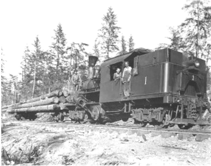
Only known photo of Gold Hill Railroad & Lumber Company No. 1

This is the short story about the Gold Hill Railroad & Lumber Company (GHR&LR Co). It is one of those little logging railroad operations that seemingly no one has ever heard about. In fact, it is because of this railroad that I began my research to document the 60-plus companies that once interchanged traffic with the 300-mile long Siskiyou line of the Southern Pacific.