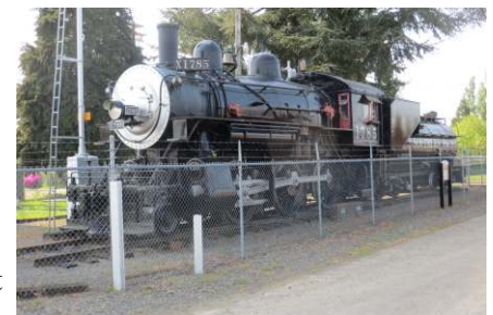
SP No. 1785 as it appears today in Woodburn

"Woodburn is here because the tracks are here. We are a railroad town in the most fundamental way possible. Our historic downtown is focused on the tracks