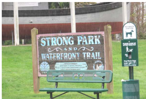
The sign at Strong Park