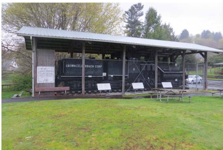
The Cathlamet Willamette at Strong Park