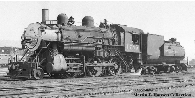
SP No. 1785 on duty in Los Angeles, March 1947

The SP No. 1785 is a 2-6-0 “Mogul” type locomotive built in 1902 by Baldwin Locomotive Works in Philadelphia. Owned and operated by the Southern Pacific railroad, the 1785 was in service from 1902-1956. It was one of 252 engines that served the Pacific Lines. Often called the “Valley Malleys”, no job was too tough for the 1700 class 2-6-0 Mogul locomotives. Originally powered by coal, the 1785 was converted to oil fuel in 1912.