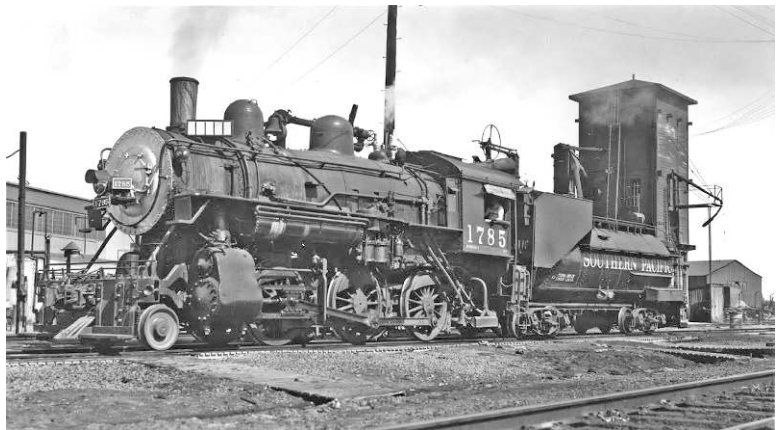
SP M6 2-6-2 No.1785 at Fresno, California, June 13, 1953.