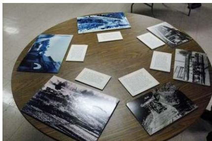
The Library/Archive Committee brought a selection of photos to view