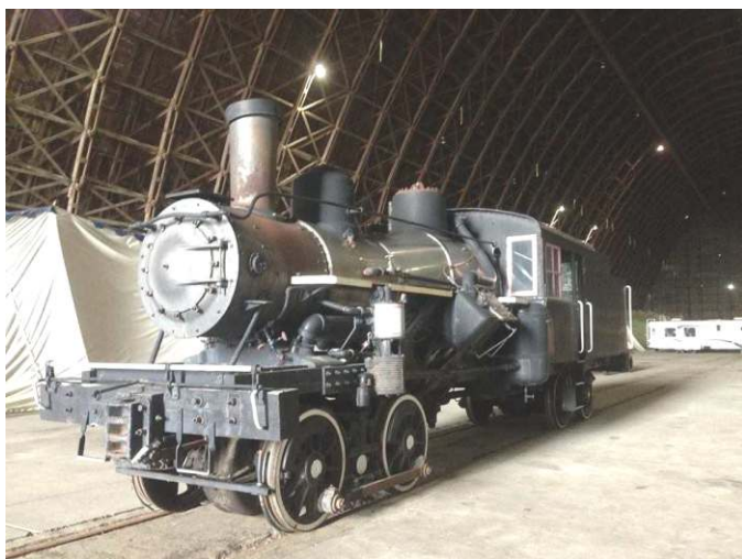
On the Rails