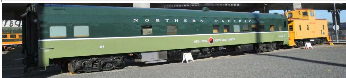
The Traveller's Rest and the UP Caboose in the front of the Oregon Rail Heritage Center.