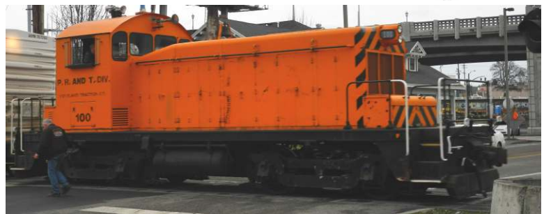
Dick Samuels walks alongside the Portland Traction No. 100 near ORHC

Rita and I are now off for the May 30 – June 7, Colorado Railways 2016 tour that touts exploring Colorado's great scenic railways and museums, sponsored by Trains Magazine and organized by Special Interest Tours. More information: www.specialinteresttours.com