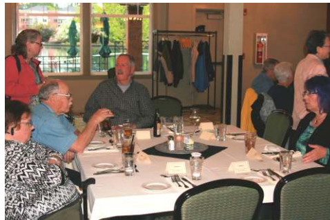
Some of the Chapter Members enjoying the Banquet