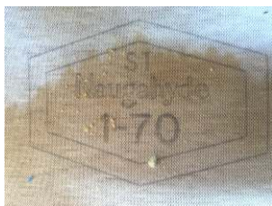
Yes, these seat covers are made with REAL Naugahyde. No Nuagas were harmed during this seat repair process.