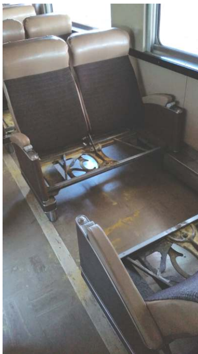
Seats awaiting their new bottoms. Note the foam dust in the frame and on the floor from the previous foam.