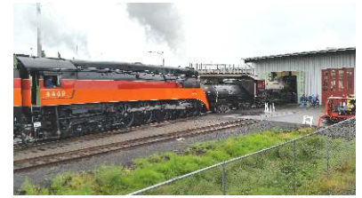
SP 4449 pushes the OR&N 197 back into the Enginehouse at the end of the day