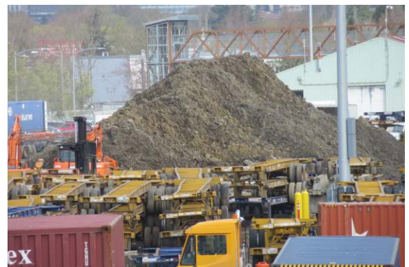
Brooklyn Yard Excavation

Union Pacific is reporting to the Oregon DEQ that during mid-March excavations at their Brooklyn Intermodal yard in SE Portland a previously unknown buried fuel tank was discovered. This century old tank contained about 750 gallons of some kind of oil and some of the oil has leaked contaminating an area 400 feet or so around the tank site. Some historians believe this tank was used to fuel steam locomotives at Brooklyn. The pile of dirt in this photo taken March 24 th looking north from the Holgate viaduct is the excavation project noted in the report to Oregon DEQ.