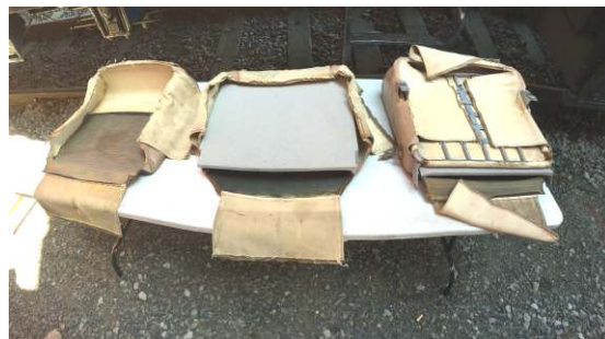
Our Assembly Line.