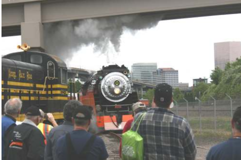
SP 4449 in Full Steam