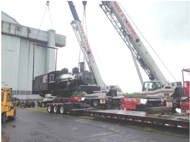
Being Lifted from the Transport Trailer

The latest “new” steam locomotive arrived in Tillamook on the afternoon of April 28, 2016. The Craig Mountain Lumber No. 3 will join the Oregon Coast Scenic Railroad (OCSR) active roster as soon as she is set up and some minor repairs are completed. This makes the fifth (!) Heisler locomotive on the OCSR roster.