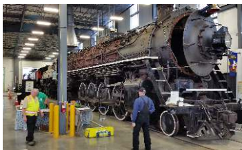
Bruce Strange (l) assisting with setup