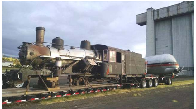
at NAS Tillamook

In September 1909 the Craig Mountain Lumber Company began construction of a six mile railroad to transport its lumber to Craig Junction where it could be transferred to the Camas Prairie Line. Service on the new railway began in January 1911; the passenger and freight train ran twice daily. In 1921 Craig Mountain Lumber Company Railway was incorporated under the laws of the state of Idaho and became Craig Mountain Railway. The mill was shut down by the final