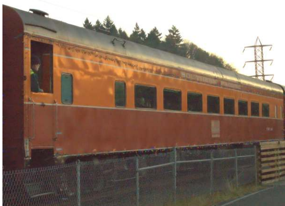
Car No. 6800 at Holiday Express

A group of folks busily replaced the seat bottom foam on the Chapter's No. 6800 coach seats in advance of its use for Portland Train Day.