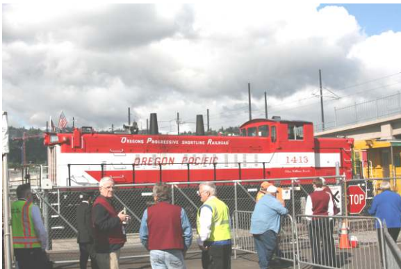
Roundtrip Rides between ORHC and Oaks Park