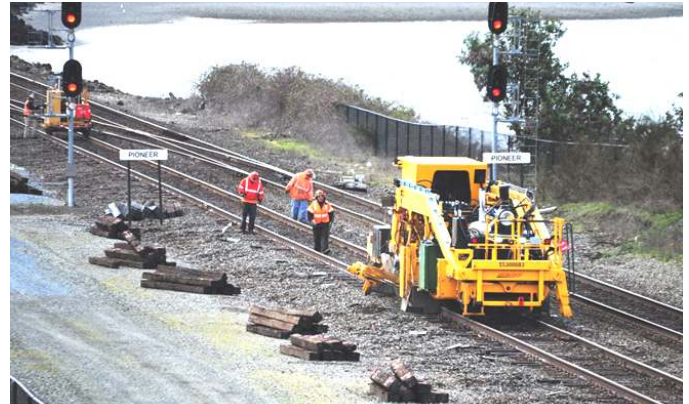
Machine squaring ties in preparation of placing tie plates. It is a combination of moving ties and tamping them. Behinds is one of the few walking crews. They are inspecting the tie and lacing the tie plates on the new tie.

The next Monday I drove through the town of Steilacoom, South of Chambers Bay. As I passed along the tracks to my delight there they were all strung out along the track in preparation of going to work that day. Each vehicle and operator was ready preform individual tasks. BNSF trucks with signal men and railroad crossing personnel were ready to make sure the equipment moved safely along the tracks,