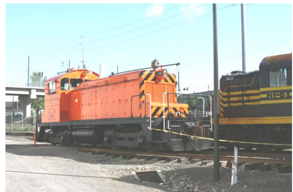
The Portland Traction No. 100 was on Display