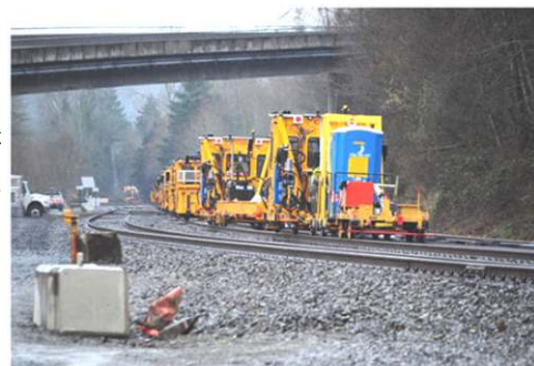
Tie replacement Crew moving through the Nisqually Valley.

An array of three Nordco Tie removal/Inserter Machines inserting ties. Working in unison, the first inserter skips the first two ties and inserts the third tie, the second inserts the second tie and the third the first tie.