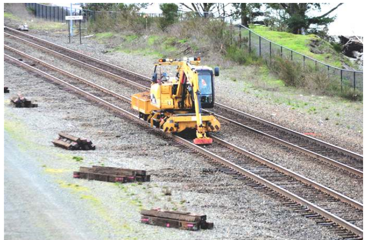
Finally time to clean up. This machine carries a magnet on it's boom to pick up any left over metal objects. It's a lovely job, but someone has to do it.