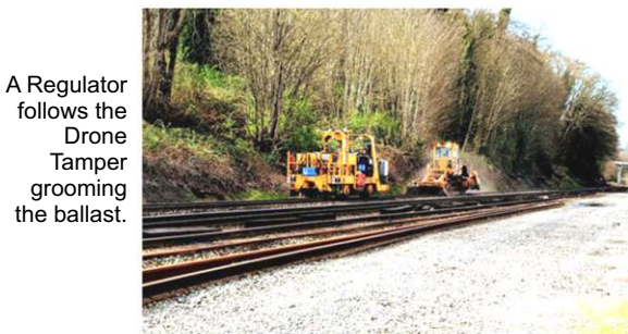
A Regulator follows the Drone Tamper grooming the ballast.