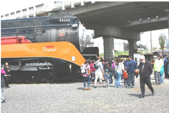
The SP4449 was on Display Out Front

The city's two other historic steam locomotives — the Spokane, Portland & Seattle 700 and the Oregon Railroad & Navigation Co. 197 — were also on display. Other activities at the event included music, food carts, train trips from the Center to Oaks Park and back by the Oregon Pacific Railroad. This year's Portland Train Day attracted over 5100 visitors. National Train Day events have historically been sponsored across the country by Amtrak until a few years ago. The Oregon Rail Heritage Foundation sponsored this and last year's event as part of its mission to promote an appreciation of the rail history of the country and the Pacific Northwest Region.