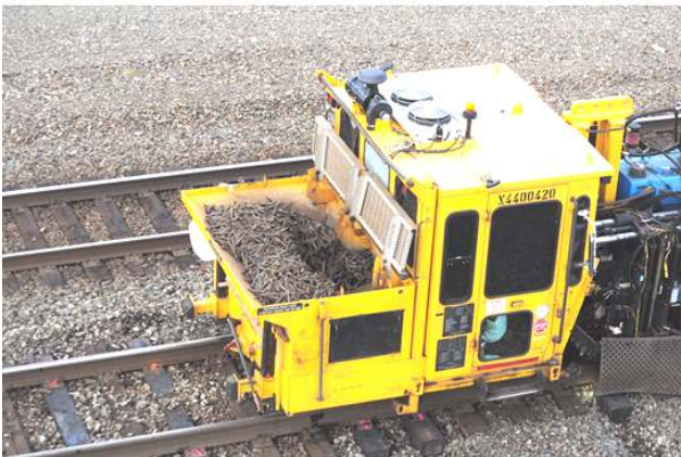
Load of used spikes ready for reuse.