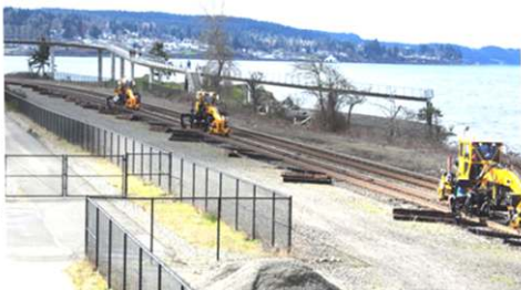
Inserting ties. Note: Removed ties are set aside and await pickup.

An array of three Nordco Tie removal/Inserter Machines inserting ties. Working in unison, the first inserter skips the first two ties and inserts the third tie, the second inserts the second tie and the third the first tie.