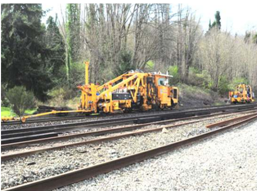
The tamper following its buggy working on the track alignment accompanied by a Drone Tamper.