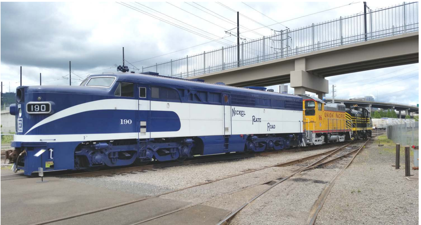
Three diesels at the Oregon Rail Heritage Center

It's 1955. While the three steam locomotives at The Oregon Rail Heritage Center (ORHC) might get all the attention, there are also currently three iconic diesel locomotives at ORHC from the 1950s.