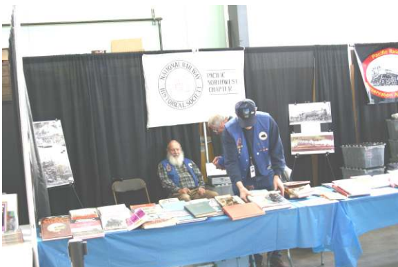
The Chapter Sold Books and other Items during the Event