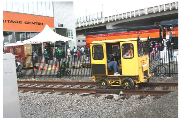
Speeder Rides during Portland Train Day