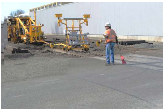
A crewman watches for traffic and signal wires attached to rails as tamper passes through the intersection at 19th St. in Tacoma, WA.