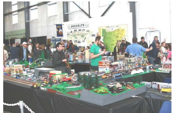
The Portland Lego Group had a Large Display