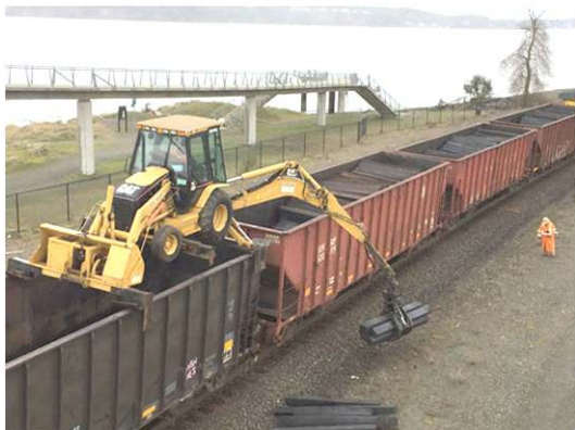
Cartopper. A Caterpillar Tractor converted by Herzog Railroad Services to load/unload railroad cars. It is capable of crawling along the sides of a car, jumping car to car and then load and unload itself to the ground.

Around the first of April 2017, I was at Chambers Bay on Puget Sound, which is a public park. As I got out of my car I noticed a tractor sitting atop some gondola rail cars. I walked over to take a look. It was a Caterpillar tractor rigged up to sit atop the walls of the gondola railroad cars. It is a tractor converted by the Herzog Railroad Services for their specific needs called a “Cartopper”. It was unloading new ties.