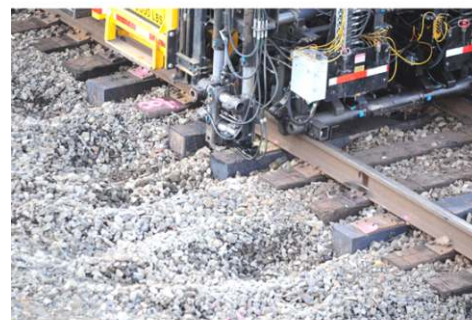
Close up of rail being lifted and tie plate being slipped under the track.