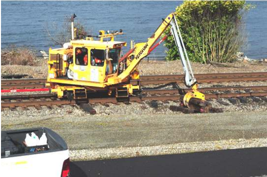
Kershaw Tie Crane at work gathering used ties for future pick up. It is following the insertion of ties keeping the rail line orderly.