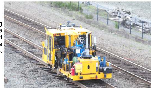
Spike-driving Machine setting and driving spikes into the ties.