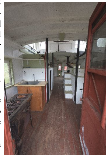
Interior of Caboose No. 507