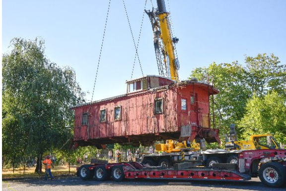
Caboose No. 507 being lifted into position