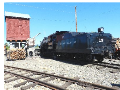
Sumpter Valley No. 19 at the Water Tank