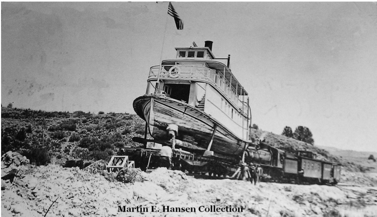
The Steamboat Klamath being moved by a Southern Pacific Steam Locomotive in 1910

Railroads in the days of steam were called on occasionally to move some very interesting loads. Here is definitely one of those moves.