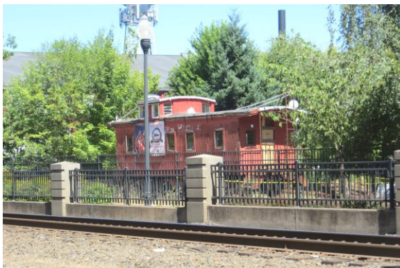
No. 507 now resides near the Union Pacific Mainline

The No. 507 resides just inside the Willamette Heritage Center fence next to the walking path that parallels the Union Pacific Railroad mainline.