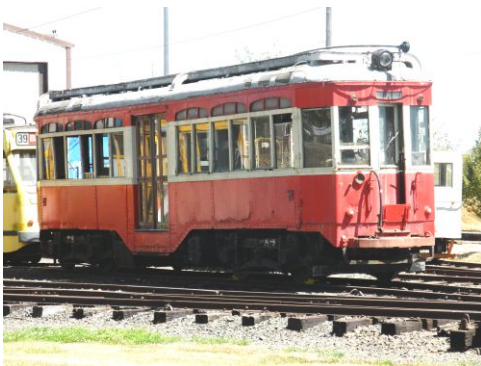
Milan Interurban Car No. 96. Built in 1930 in Italy. One of only 4 cars built. Seats 36. Owned by the Oregon Electric Railway Historical Society. Moved onsite in late 2016.