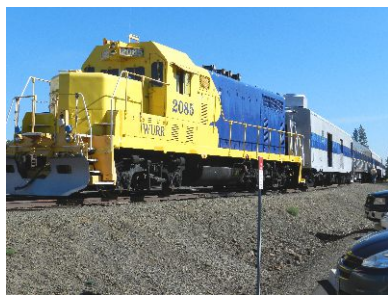
Eagle Cap Train

On Saturday we headed back to Elgin to ride the Eagle Cap Excursion Train which runs eastward as far as Vincent with a locomotive on each end. The cars are all air conditioned except for an open baggage car and very comfortable. The staff is all volunteer and fantastic. All of us remarked on how good they were. They talked to everyone, but did not let announcements or stories interfere with enjoying the scenery. Lunch is part of your fare and it is a somewhat expensive trip, but beautifully handled. We had seats on both sides of the car, so we traded seats regularly.