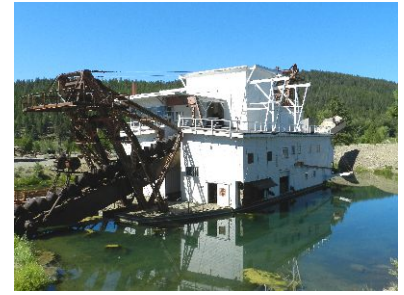
Gold Dredge at Sumpter