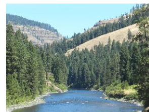
View of Wallowa Lake