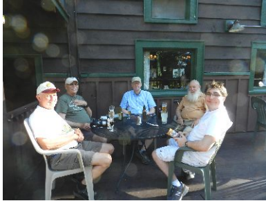
The Archives Crew at Wallowa Lake Lodge

The railroad was originally built to haul lumber, in the form of rail ties, to a connection with what is now the UP at Baker City. The discovery of gold changed the complexion of the operation somewhat and the reconstructed "Gold rush extension" from McEwen to Sumpter is what remains of what was once an eighty mile railroad which extended from