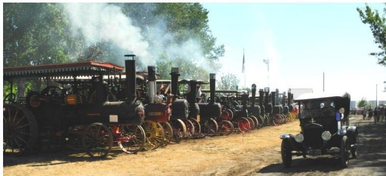
View of Steam Tractors being Reviewed by an Antique Car at Steam Up