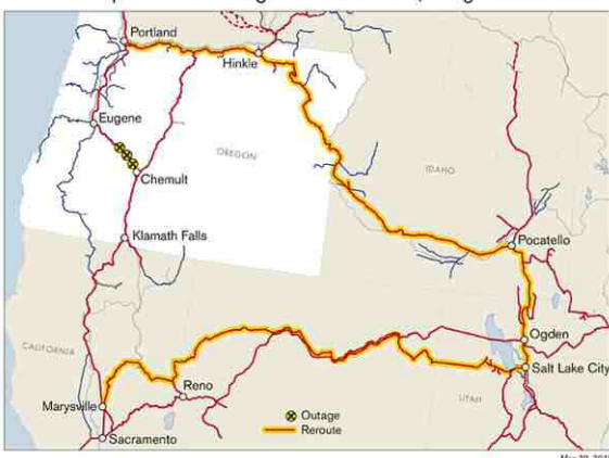
Tunnel Collapse between Eugene and Chemult, Oregon