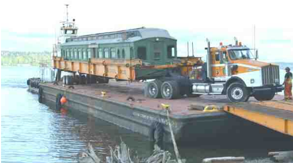
Backing Car No. 1799 onto the Barge

By 6:50 in the evening, Parlor Car 1799 was on its way to Seattle! Tug Carolyn H. pushed it down the east coast of Puget Sound along the route of the Great Northern (BNSF). About the time of the Parlor Car's departure, a northbound Amtrak Cascades train was observed on the distant shore.