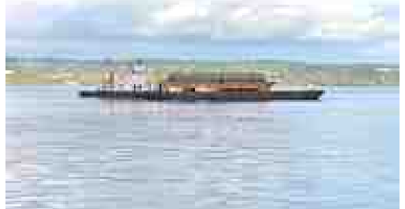
No. 1799 On the Way to Seattle

Facilitating the preservation of the Parlor Car has been a monumental task, and it is not complete yet. Please help the Northwest Railway Museum complete the effect with a contribution to the NP 1799 restoration fund, www.trainmuseum.com or by USPS to: PO Box 459, Snoqualmie WA 98065-0459.