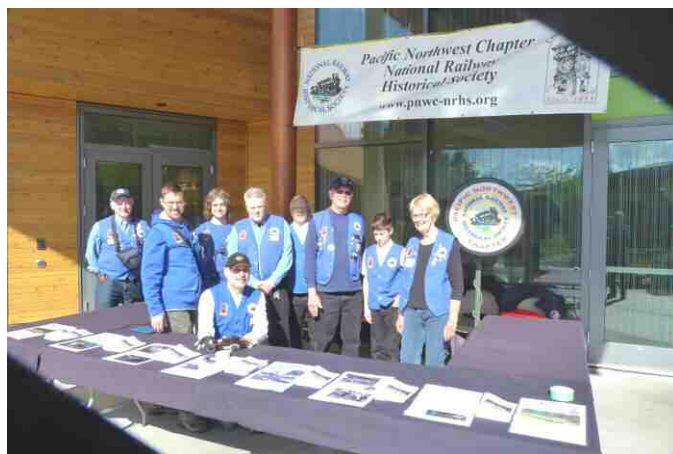
The Chapter Volunteers at the Zooliner 60th Event on June 11th

REMINDER, the requested donation for snack time is three dollars