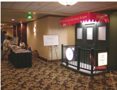
The Platform at SP&S Swap Meet