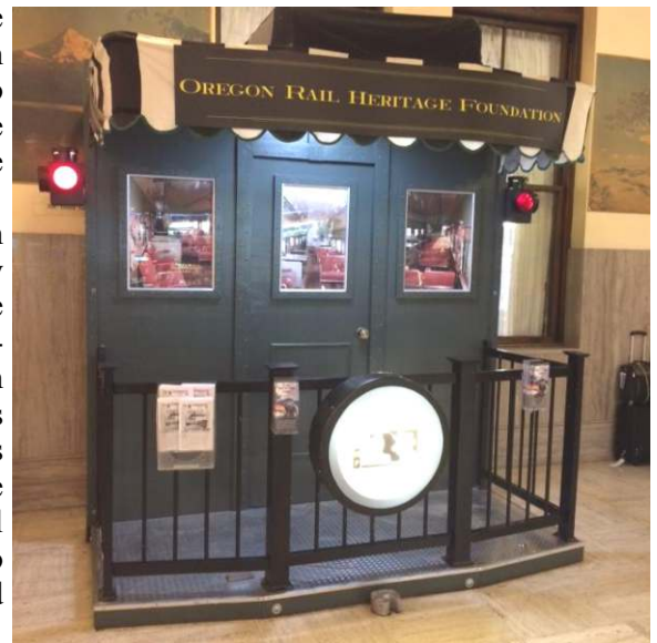
The Platform at Portland Union Station