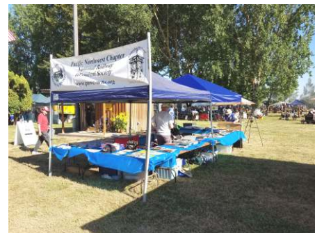
Chapter Booth at Steam-Up