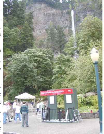
The Platform at Multnomah Falls

In November 2008 the Chapter was invited to provide a display at OMSI for promotion of the ORHF Holiday Express, so I decided it was time for a major upgrade. I hauled the display home, where it took over my garage for the next two weeks. The large base was redesigned to allow the railings to be removed and folded up, saving a lot of space. A lightweight truss was fabricated to give the display a realistic roofline, covered with an awning custom sewn by Jean Hickok. I added a modular electrical system to power the drumhead and replica marker lights I hand built. A ceiling was added with a working light dome. Darel Mack hand carved a replica coupler, painted silver. The "windows" were upgraded with color photos and acrylic glazing to give the appearance of looking into a railcar's lounge. Brochure racks were installed and informational signs added. The purpose of the display was no longer to be a conversation piece among railfans, it was now an information center for the general public.