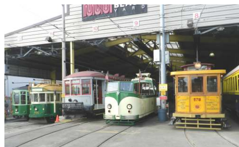
Cars at the Muni Shop

walk along it with impunity. There is a park that the line runs through with not only great track views, but also a beautiful view of downtown. Ride the J line.