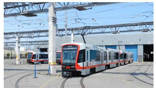
Light Rail Equipment

Green Yard is where the newer LRV's are serviced. Depending on the time of day the facility can be packed with units ready for service. Kitty corner from Green Yard and almost across the street from the start of the J line is Cameron Beach Yard. This where almost all of the heritage cars are kept and serviced. The Muni historical collection is also kept there. They have some wonderful old San Francisco cars dating back to the early 1900's, fully restored, that usually only come out when they have a streetcar parade. They also have such oddities as a double ended Blackpool open sightseeing car. The only other one I know of is on the east coast near Washington. I was lucky enough to see it running, sans passengers, as it was being moved to Muni's third facility.